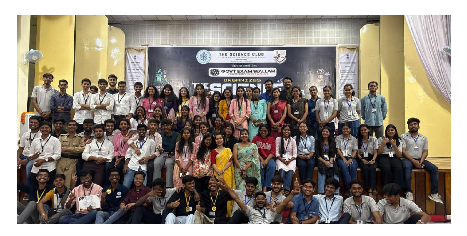
The Event stood as a testament to the vibrant scientific culture at St. Xavier's College, Ranchi.

The Science Fair ended with appreciation and reflection. Winners of the quiz, debate, and exhibitions received certificates and applause for their efforts. Faculty and chief guests praised the students' dedication and creativity. Volunteers and organizers were acknowledged for their smooth management. The event inspired curiosity, teamwork, and a passion for science among participants. It concluded on a high note, motivating everyone to keep exploring, learning, and innovating in the future.