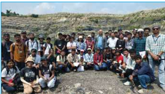
Field Training at Sikni Coal Mines, Auranga Basin, Latehar District, Jharkhand

The field training aimed at providing students with practical exposure to coalfield Geology, lithological variations, structural settings, and the stratigraphic framework of coal-bearing formations. The Sikni coal mine, operated by the Jharkhand State Mineral Development Corporation Limited (JSMDC), forms part of the easternmost Gondwana coal basins of the North Koel Valley and represents an ideal site to study the Geology of the Barakar Formation, the principal coal-bearing unit of the region.