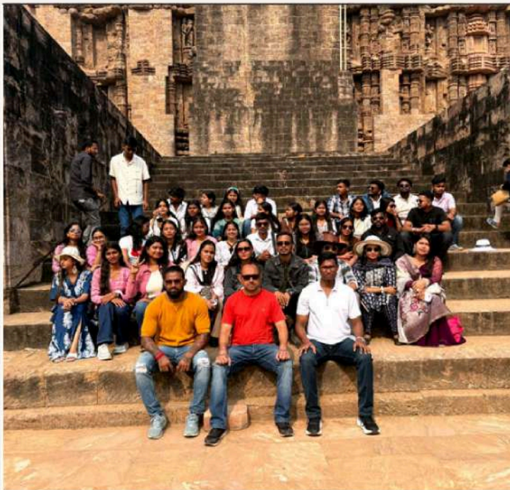
Konark Sun Temple visit

The third day of the camp was marked by a felicitation and certificate distribution ceremony held at the hotel, recognizing the participation and discipline of the volunteers. As per the itinerary, the rest of the day was allotted for self-exploration, during which volunteers explored local markets and nearby places, enhancing their understanding of local culture, lifestyle, and traditions.