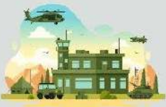
Visit to military Establishments