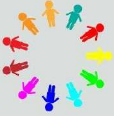
National Integration Awareness Programme