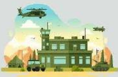
Visit to military Establishments