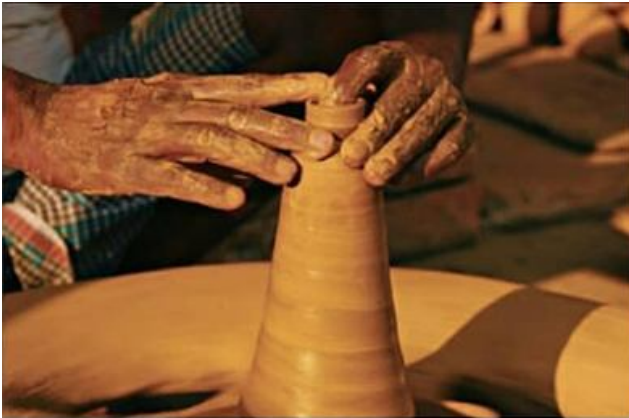
1ST - ADITI KACHHAP