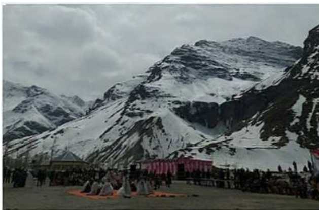
3RD - MANSI MITTAL