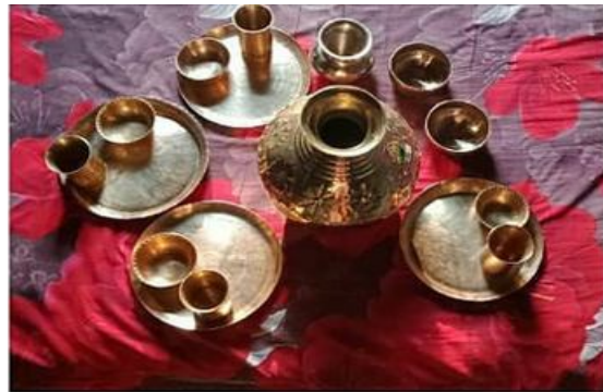
2ND - ANIKET TOPPO