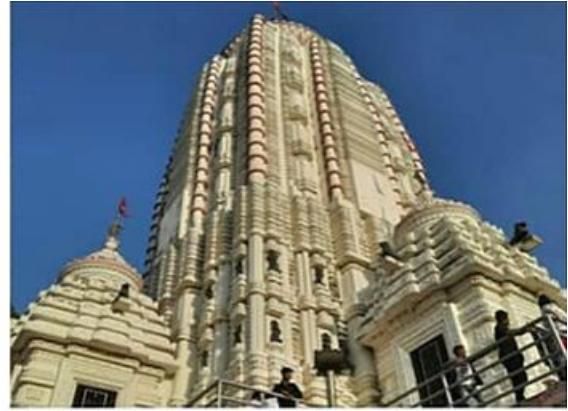
2ND - DIGYA SINGH