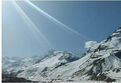
3RD - MANSI MITTAL