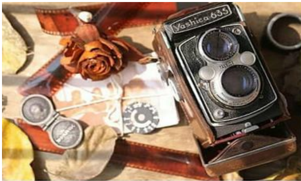
1ST - YUKTI RANJAN